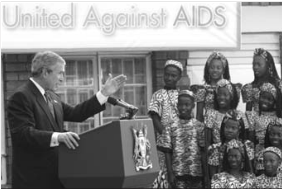
U.S. President George W. Bush talks about AIDS to the orphaned children of Ugandan parents who have died of AIDS at The AIDS Support Organisation (TASO) center in Entebbe, Uganda, July 11

hate AIDS and they want to see an end to it.