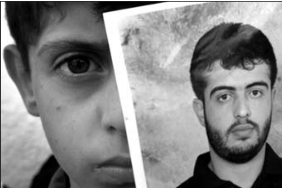
A Palestinian boy holds a portrait of a relative who is being held in an Israeli jail during a protest demanding the release of Palestinian prisoners in Gaza City Aug. 4