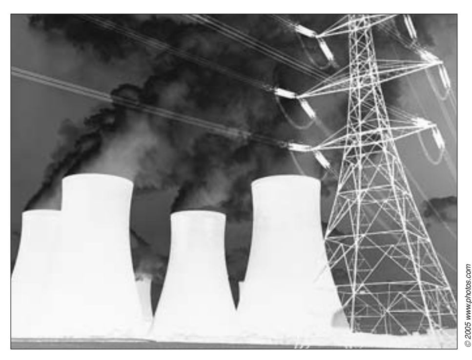
Iran maintains that it intends only to generate electricity through nuclear power . . . The reality that makes it next to impossible to simply take their word for it is the fact that the paths to nuclear power generation and to nuclear weaponry are identical.

Iran's continuing sponsorship of terror in his State of the Union address, encouraging Iranians to "stand for liberty," a not-so-subtle encouragement to revolutionary elements within Iran. Understandably, U.S. concerns include the possibility that Iran might hand terrorists material they need to construct a "dirty bomb," a conventional explosive device that disperses radioactive material.