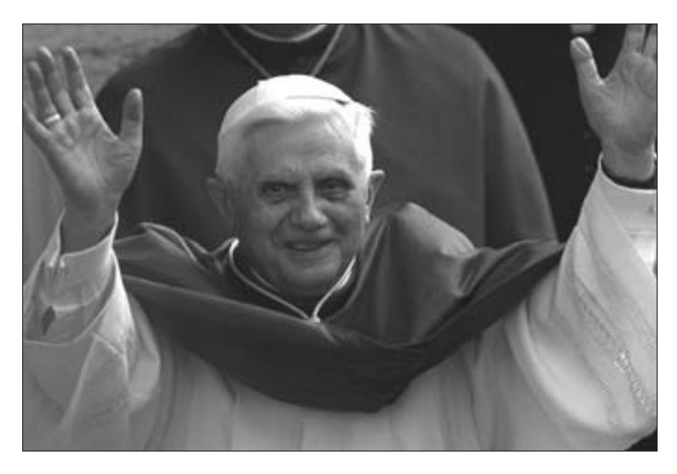
Pope Benedict XVI arrives for a celebration service in St. Paul's in Rome April 25.

Such an arrangement has been suggested in the past as a means of regulating the disparity in size and influence of the many nations who either are planning to seek or are seeking EU mem-