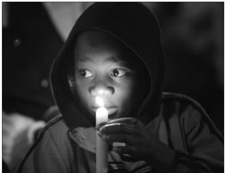
A resident of Ngwenya village attends a candlelight memorial for AIDS victims May 21, 2005. Impoverished Swaziland is battling the highest HIV infection rate in the world, with around 40 percent of adults living with the disease.

James wrote to the scattered Israelite tribes in the first century, taking his readers to task for the suffering their peoples were causing. "Where do wars and fights come from among you? Do they not come from your desires for pleasure that war in your members? You lust and do not have. You murder and covet and can-