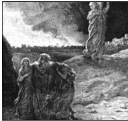
An artist’s conception of the destruction of Sodom.

The primary part of Luke’s version of the Olivet Prophecy is located in the 21st chapter. Jesus’ general warning against