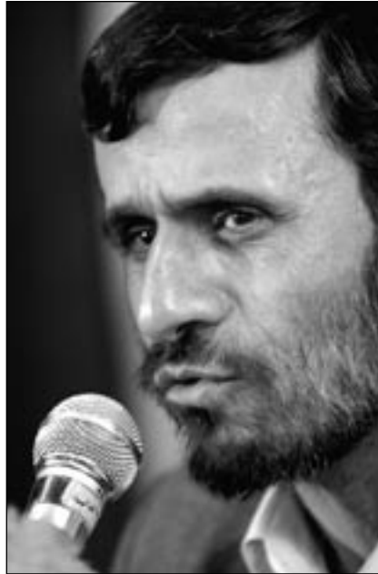
Iranian president-elect Mahmoud Ahmadinejad speaks during a news conference June 18.