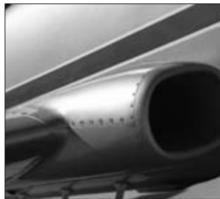
A standoff with Iran could push oil as high as $150 a barrel, pushing airlines to financial disaster.

Coupling such admissions with Ahmadinejad's inflammatory speeches, it is hard to take seriously the current Iranian nuclear negotiating policy, which in essence is, "Trust us. We would never produce a weapon of mass destruction. You have our word on it." Iran's hard-line clerics, for whom Ahmadinejad speaks, might actually welcome a military attack by America or Israel, relishing the chaos that would ensue.