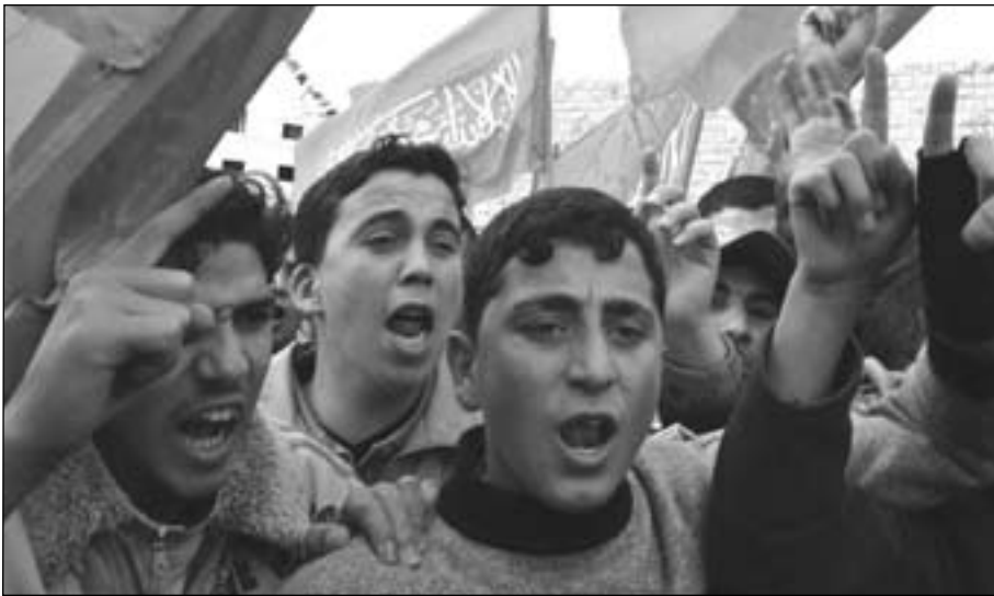
Palestinian supporters of the Islamic militant group Hamas protest over Danish cartoons of Muhammad Feb. 1.

giving special protected status to Islam. The only compromise acceptable to the Islamic world would mean the death of freedom of expression in the West!