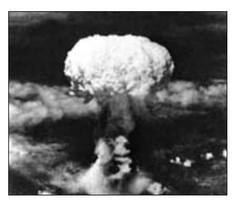
The world won't end this way...

ur news reports— and the world's top secret intelligence reports probably even more so—reflect a dangerous world. Dozens of hot spots seem ready to explode into wider violence. Weapons of mass destruction are falling into the hands of despots and terrorist groups. Tensions between races, nations and groups of nations seem to be continually increasing.