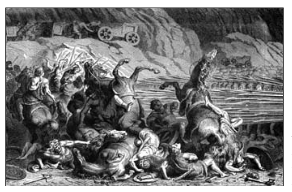
"Alexander's revolutionary practice of total pursuit and destruction of the defeated enemy ensured battle casualties unimaginable just a few decades earlier."

came to dominate the world through warfare. "The Western way of war is so lethal precisely because it is so amoral—shackled rarely by concerns with ritual, tradition, religion, or ethics, by anything other than military necessity... The idea of annihilation, of head-to-head battle that destroys the enemy, seems a particularly Western concept... Westerners, in short, long ago saw war as a method of doing what politics cannot, and thus are willing to obliterate rather than check or humiliate any who stand in their way" (pp. 21-22).