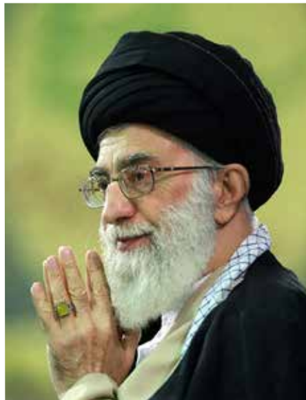
Two weeks after the Iranian nuclear agreement was signed, Iranian supreme leader Ayatollah Ali Khamenei published a book denying the Holocaust and calling for Israel's destruction.

Even assuming the president is correct, his argument can be turned around to say that the alternative to a war to prevent Iran from developing nukes is this deal—an agreement that paves the way to further