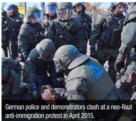
German police and demonstrators clash at a neo-Nazi anti-immigration protest in April 2015.

recently reported on the resurgence of racially motivated violence and harassment in parts of the country: "Germany these days is a nation split in two. On the one side is a populace that is showing greater solidarity with refugees than ever seen before . . .