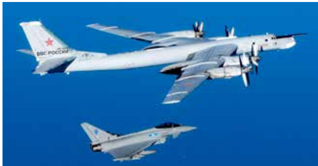
A British RAF Typhoon intercepts a Russian bomber near UK airspace.

Put your trust in God and pray fervently for His will and purpose in the world. (Source: Financial Times .)