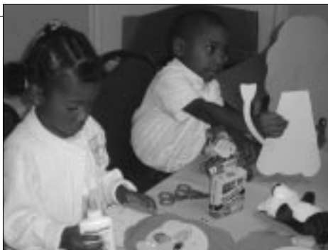
Festival Youth Instruction at Panama City Beach ; right, Mont Sainte Anne ; below, Branson, Missouri