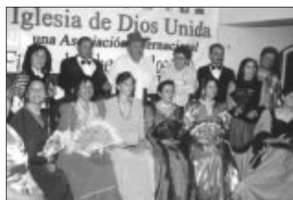
Chile

"The first night I was inside the door a whole 10 seconds before I was bombarded by a huge group of excited friends! We all started talking about how great this Feast was going to be!" Wisconsin Dells