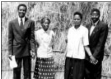
Jekyll Island