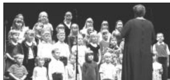
Corpus Christi