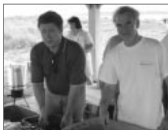
Panama City Beach