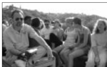
South Africa