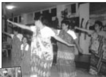
Davao City, Philippines