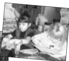
Wisconsin Dells

"The first night I was inside the door a whole 10 seconds before I was bombarded by a huge group of excited friends! We all started talking about how great this Feast was going to be!" Wisconsin Dells