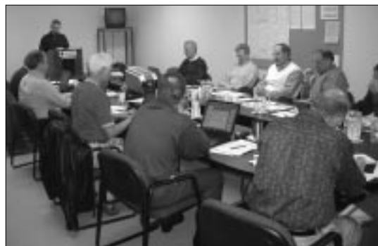
United Youth Camp team meets in the conference room at the home office November 12 through 14

camp, 97 percent of those responding said the camps were successful in accomplishing their goals and 96 percent said the overall effect was good for their children. Selected remarks included: "I realize there is nothing more important for my children to do during