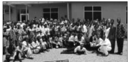
Remnant Church of God Feast sites in Ghana