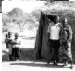
Zambia