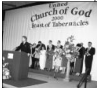
Noosa Heads, Australia