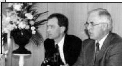
Taupo, New Zealand