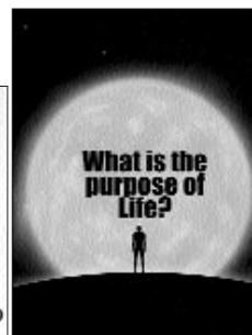
Inserts to be placed in "Good Stuff College Packs" this fall

sometimes referred to as the "net generation." In this test 250,000 inserts promoting