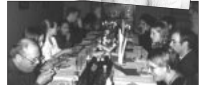
These mysterious servers made the Toronto Mystery Dinner a success

be chocolate turtles. What a relief that was!