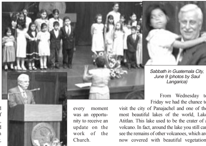
Sabbath in Guatemala City, June 9