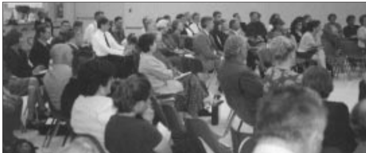
Lethbridge, Alberta, has record attendance June 9 when the Canadian national council visits