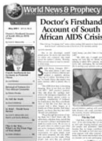
Mock-up of redesigned World News and Prophecy