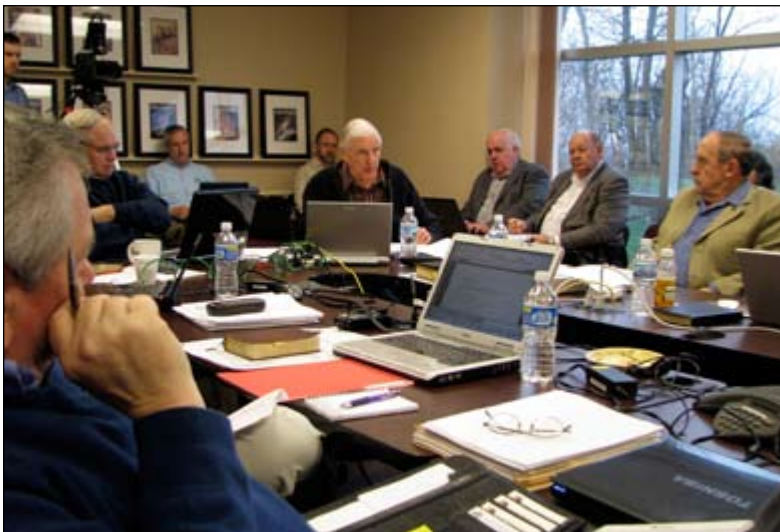
The Council discusses elements of the media plan

Visit the Council of Elders’ Web site, http://coe.ucg.org to read the full Council reports.