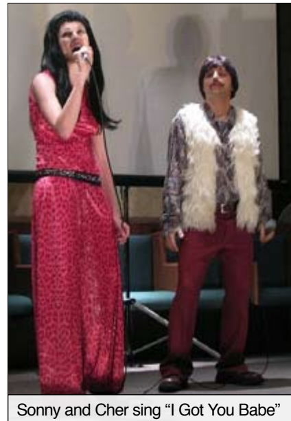
Sonny and Cher sing "I Got You Babe"

them to make an intermission necessary. The final performance was a surprise showing by Sonny and Cher singing, "I Got You Babe." Due to circumstances beyond everyone's control, the acts had no time to rehearse on stage beforehand, and the sound crew had about two minutes per act to prepare. But the show had to go on and so it did, with only minor