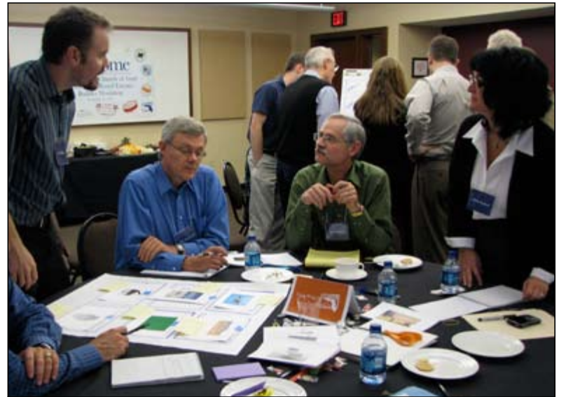
Attendees of the Brand Essence Workshop on Nov. 18 discuss the unique attributes of the United Church of God

Speaking of the power of a well-conceived brand, Cooke writes, "Thousands of companies today use the smash test to evaluate their brands. In other words, if your logo was removed from the product, would the colors, graphic