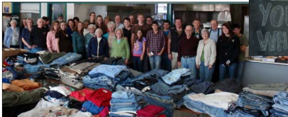
Team Beloit prepares for the Great Clothing Giveaway