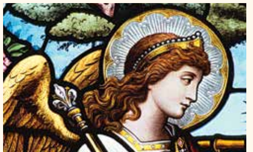
Angels do not have halos, which can be traced to ancient depictions of false gods.

The idea of portraying angels and biblical personages with halos can be traced back to ancient Egypt. There the sun god Ra and other Egyptian deities were depicted with a solar disc (representing the sun) atop their heads.