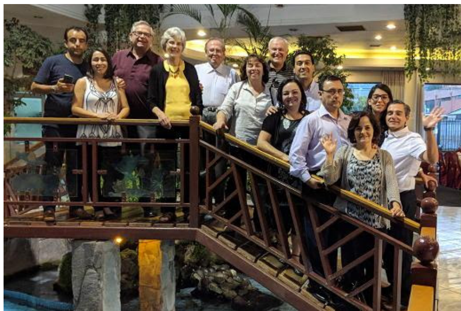
Gathering of ministers and wives at the ministerial conference in Santiago, Chile.